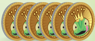
30 Yummy tokens