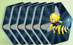
6 Wasp tokens