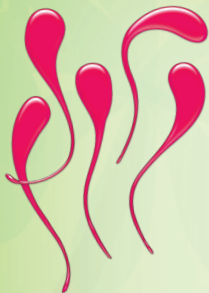
8 sticky tongues (including 2 spare tongues)