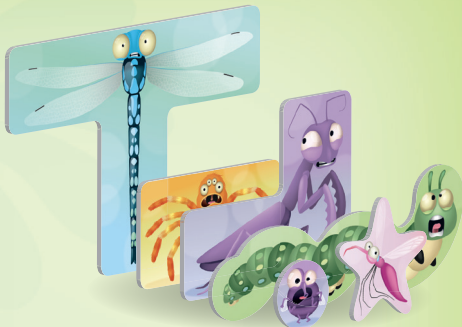
30 Insect tokens (6 x 5 different colors)