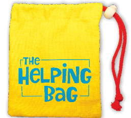
1 Helping Bag