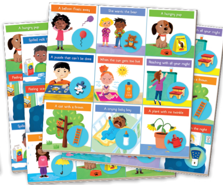
4 Game Boards