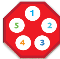
1 Stop Sign