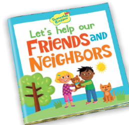
Friends and Neighbors book

Imagine you are going for a walk in your neighborhood. Along the way you encounter friends and neighbors who need a little help. Some are sad, others are mad, or scared, or frustrated. Can you tell what each one is feeling? You can help by reaching into The Helping Bag to find just what each needs to feel better.